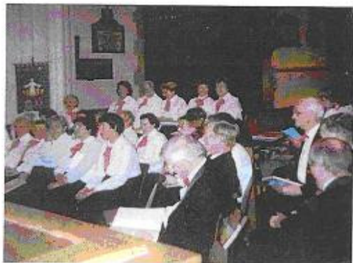
Wareham Choral Society in Concert - November 2000